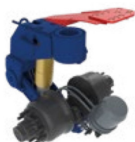
Pendular axle with pivot bearing

Transport of an industrial boiler with a combination comprising a THP/ET 8 (3+5) with gooseneck and boiler bridge.